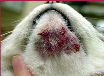
Feline Chin Acne