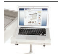
Laptop Platform Your laptop held securely.