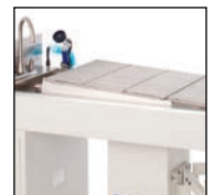
Grate Tilt Fits under grates.