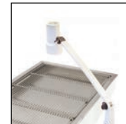
LED Procedure Light Bright, focusing, flexible.