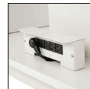
4 Electrical Outlets