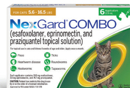
WEIGHT 5.6-16.5 LBS

IMPORTANT SAFETY INFORMATION: NexGard® COMBO (esafoxolaner, eprinomectin, and praziquantel topical solution) is for topical use only in cats. Use with caution in cats with a history of seizures or neurologic disorders. The most frequently reported adverse reactions include vomiting, application site reactions, and anorexia. If ingested, hypersalivation may occur. Avoid direct contact with application site until visibly dry. For more information, see full prescribing information or visit NexGardCOMBOclinic.com.