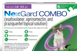
WEIGHT 1.8-5.5 LBS

Receive 120-day payment terms. Offer good on all orders placed before June 30, 2023